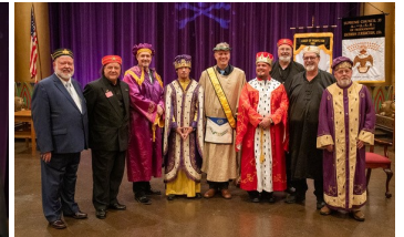
4th Degree Team